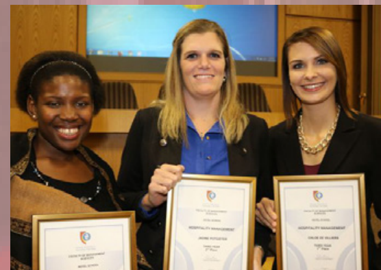
Best Third-year Students